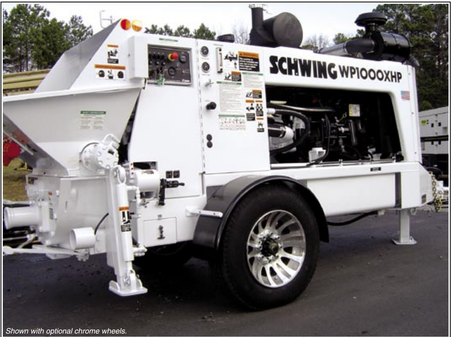
Shown with optional chrome wheels.